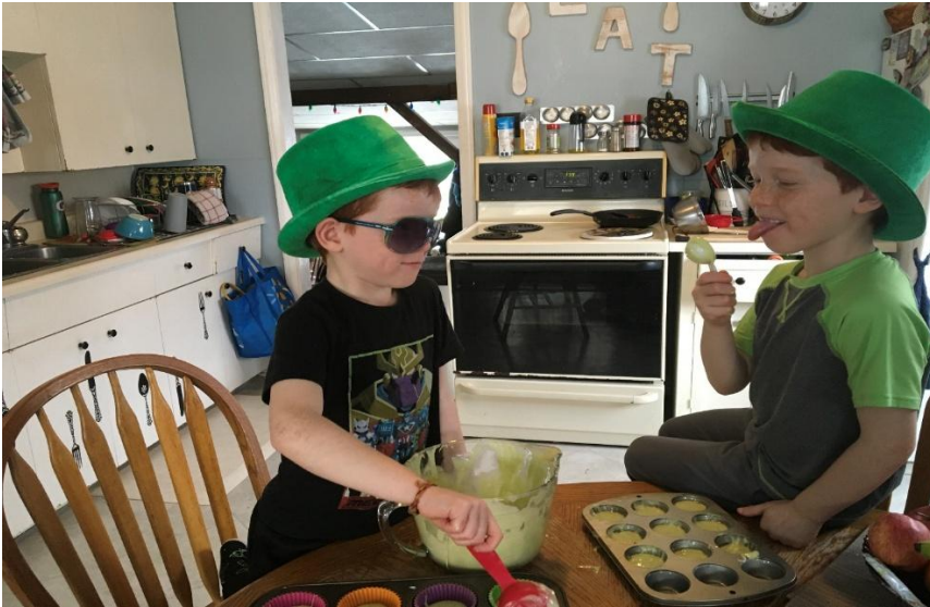
Lynn's twin grandson's celebrating St Patty's Day

We Still have some jams for sale; Hot Pepper, Strawberry & Peach, 125ml - $3, 250ml - $5. Contact Maryjane @ 519-878-0340