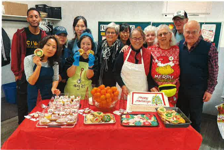
Some Welcome Wednesday volunteers