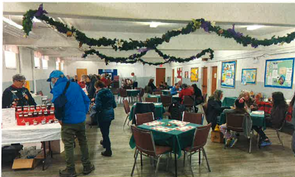
Friendship Hall Activity

Several jam sessions were held from June to November in order to stock the deli table. The surprise big seller for 2024 was our new Merry Christmas Jam ... a sweet, tart and zesty combination of strawberry, cranberry and orange.