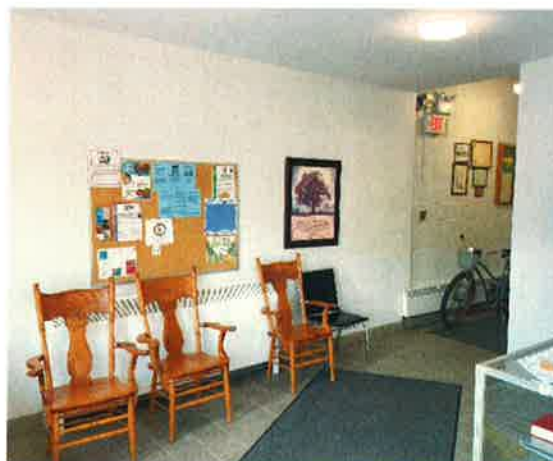
Submitted by the Property Committee