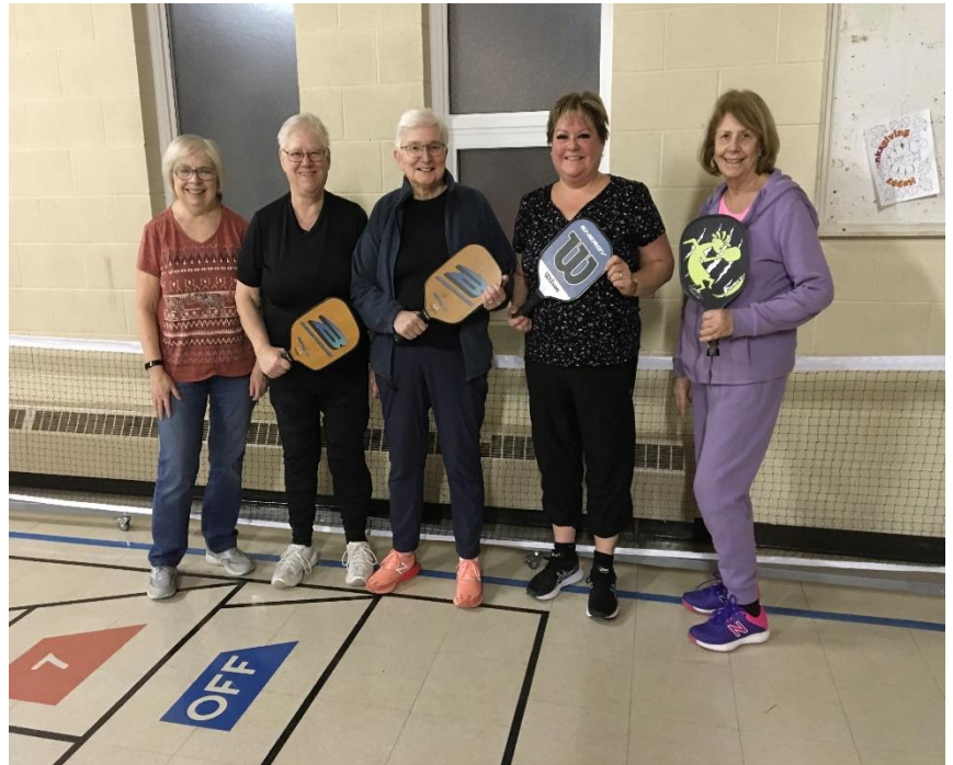
Figure 6 Friday night Pickleball group