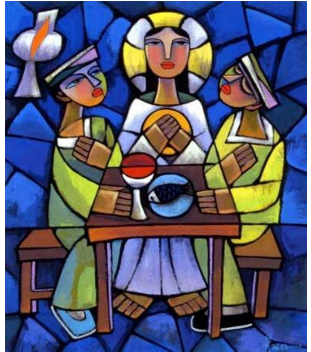
Figure 1" Untitled Artwork 19 by Girish Advannheg

Wouldn't you be fearful when everything you knew and understood about your world had been ripped apart and put back together in an amazing way?