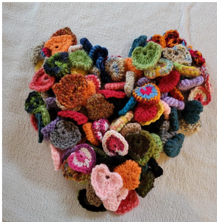
Figure 3 Our Secretary Laura knit these beautiful hearts