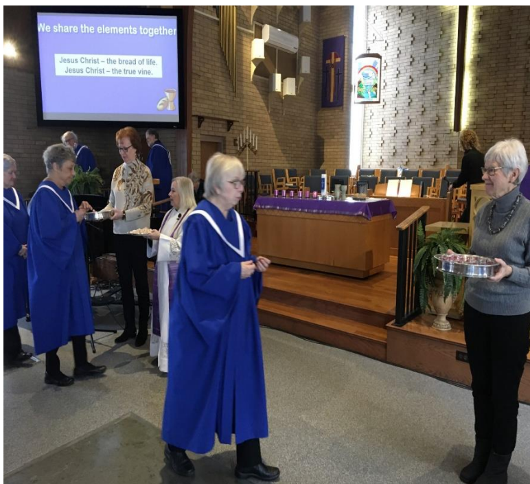
Figure 2 Serving Communion on Advent 1