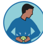
Nausea, vomiting or diarrhea (age <18 only)