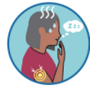
Very tired, sore muscles or joints* (age 18+ only)

If you have an existing health condition that gives you the symptoms, select "No," unless the symptom is new, different or getting worse.