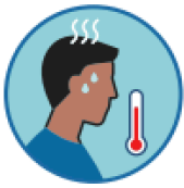
Fever or chills

1. Do you have any of the following new or worsening symptoms or signs?